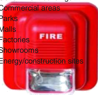
HOOTER CUM FLASHER