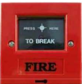
MCP PUSH BUTTON TYPE