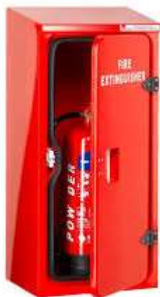
FIRE EXTINGUISHER CABINATE